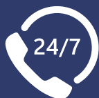
24/7 Private GP Service via Video Call