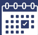
25 Days Leave + A Day Off For Your Birthday