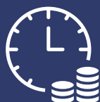
7% Employer's Pension Contribution