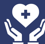
Private Medical Insurance