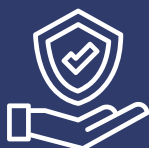
Life Assurance Cover