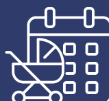
Enhanced maternity, shared parental & adoption policies