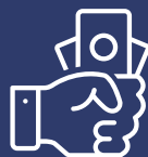
Salary Sacrifice Scheme