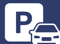
Your Own Desk In Estate Office & Free Parking